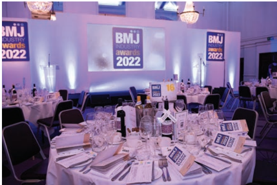
Table of 10 - £2900 Table of 5 - £1600 Single ticket - £315